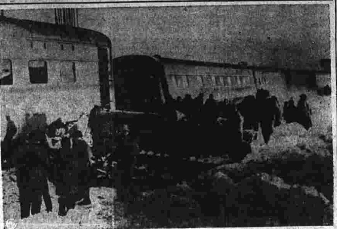
A wrecking crew clears away debris from the rear of the City of Los Angeles, which was derailed after hitting snowplow bulldozer near Pine Bluff, Wyo. All of the passengers escaped injury.