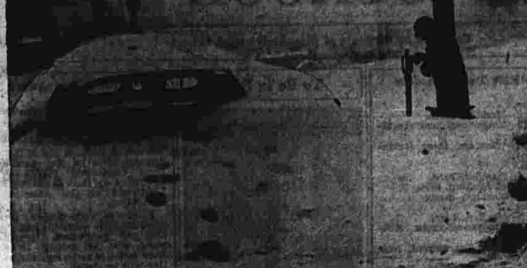
Diogenes, who spent a long time searching for an honest man, would have loved to stop off in Keosauqua, Neb. For here's an honest man at work. He's putting his money in a parking meter, even though his car is buried in several feet of snow.